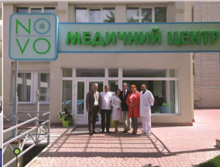
President of Ukraine Viktor Yushchenko with NOVO management