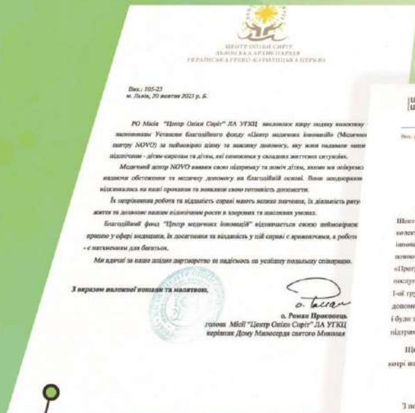
Gratitude from "Orphans' Care Center" for many years of assistance to children deprived of parental care