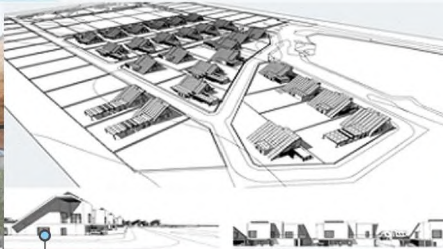
"Sadyba Veterana" Project