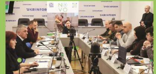
○ round-table in Kyiv, 23rd January 2024