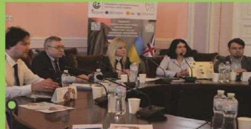
○ focus group, 9th January 2024