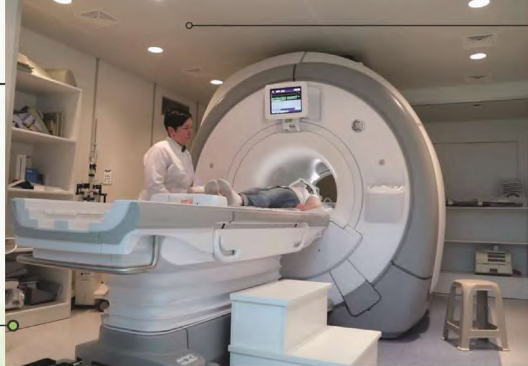
Optima MR450w 1.5T magnetic resonance imaging scanner

OPTIMA MR450W 1.5T MAGNETIC RESONANCE IMAGING SCANNER MANUFACTURED BY GENERAL ELECTRIC HEALTHCARE PROVIDES THE HIGHEST IMAGE QUALITY WITH A SHORTER EXAMINATION TIME. DUE TO THE UNIQUE DESIGN OF THE DEVICE, MRI DIAGNOSTICS CAN BE DONE FOR BOTH SMALL PATIENTS AND PEOPLE SUFFERING FROM CLAUSTROPHOBIA.