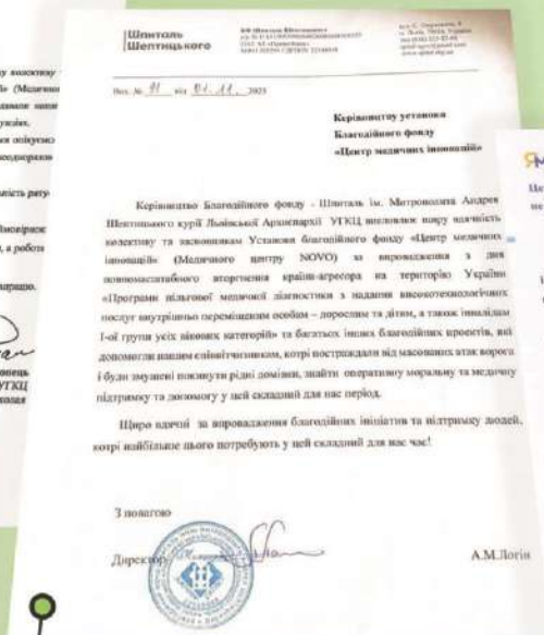
Gratitude from Sheptytsky Hospital for implementing charitable initiatives for internally displaced persons