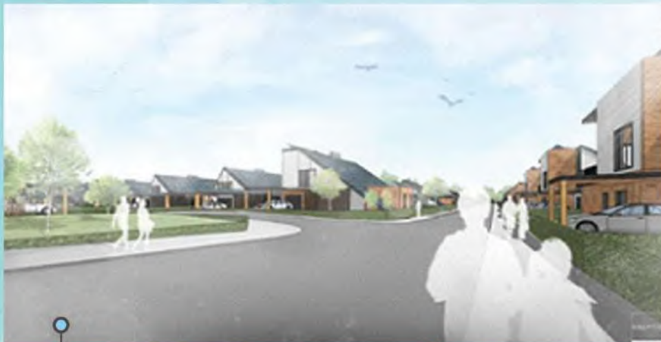
visual of the "Veteran Estates" project

GOAL: TO SUPPORT MILITARY PERSONNEL BY PROVIDING ACCESS TO MEDICAL SERVICES