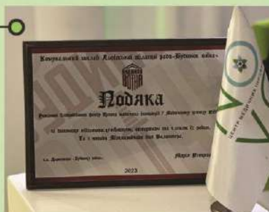
Gratitude from Communal Institutions of Lviv Oblast Council "Warrior's House" for helping the military and their families