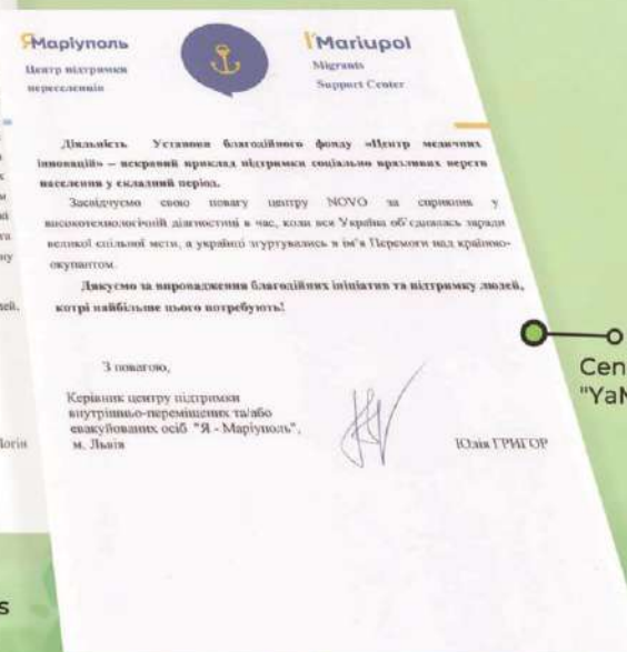
Gratitude from the Center for IDPs Supporting "YaMariupol"