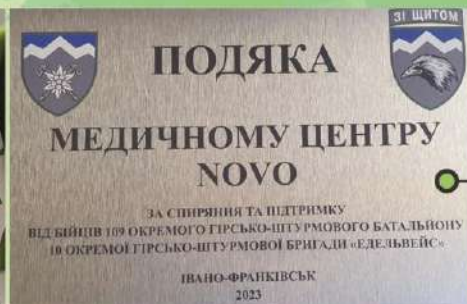
Gratitude from mountain assault brigade "Edelweiss"