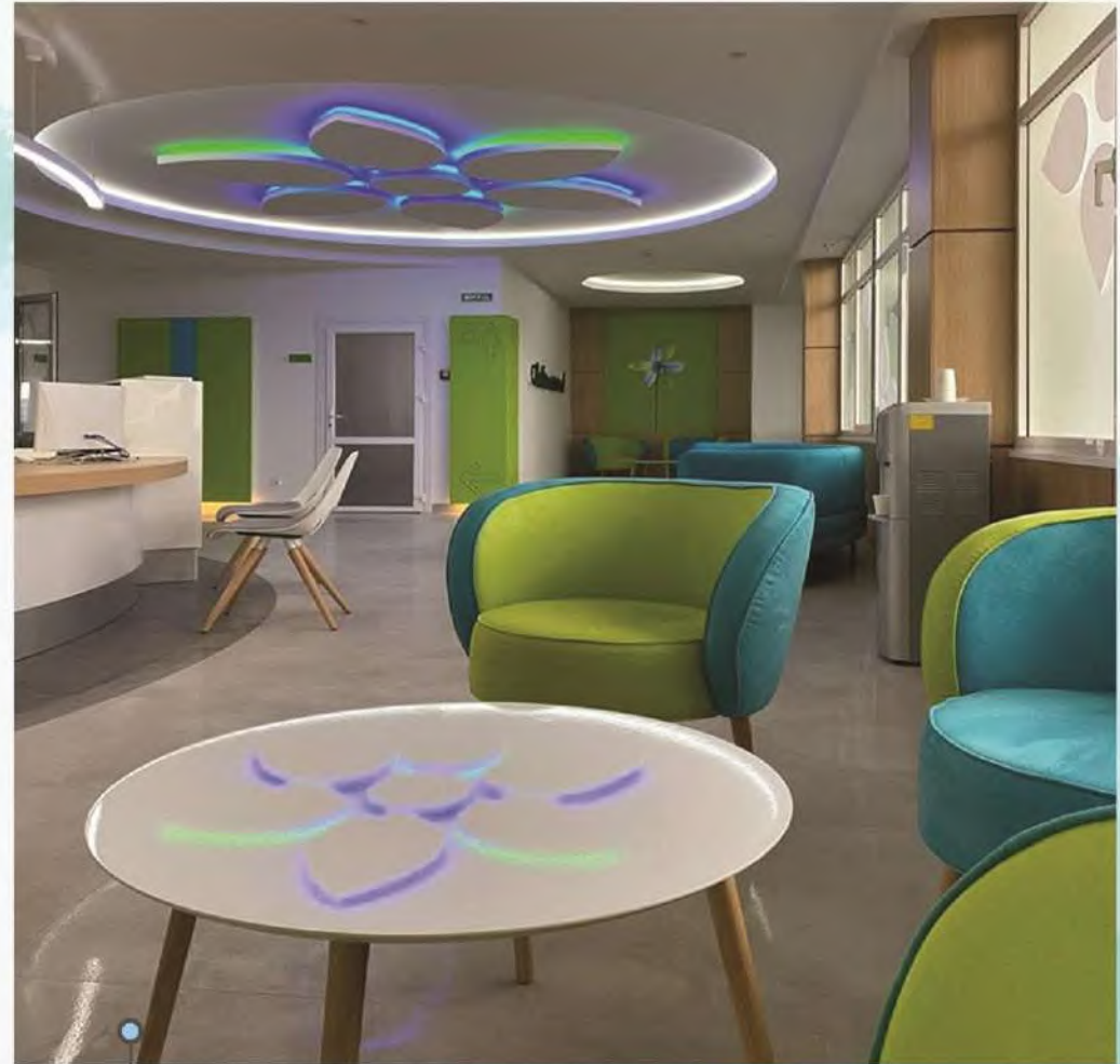
one of repaired premises