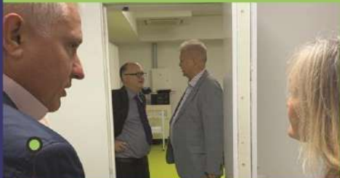
○ Visit of representatives of Great Britain Embassy, 10th October 2023