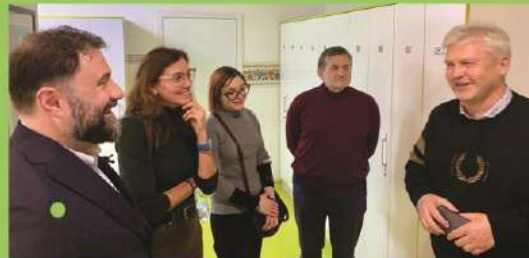
○ Grantors' visit on 1th November 2023